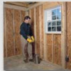
With Bora-Care, the wood, concrete and plumbing penetrations are treated, providing long-term residual protection from termites and other wood destroying organisms.